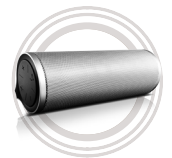
Lenovo 500 2.0 Bluetooth® Speaker