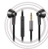
Lenovo 500 Extra Bass In-ear Headphones