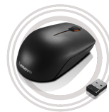
Lenovo 300 Wireless Compact Mouse