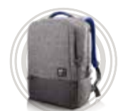
Lenovo 15.6" NAVA On-trend Backpack

Lenovo reserves the right to alter product offerings and specifications at any time, without notice. Lenovo makes every effort to ensure accuracy of all information but is not liable or responsible for any editorial, photographic or typographic errors. All images are for illustration purposes only. For full Lenovo product, service and warranty specifications visit www.lenovo.com . Lenovo makes no representations or warranties regarding third party products or services. Trademarks: The following are trademarks or registered trademarks of Lenovo: Lenovo, the Lenovo logo, ideapad, IdeaCentre, yoga and yoga home. Microsoft, Windows and Vista are registered trademarks of Microsoft Corporation. Ultrabook, Celeron, Celeron Inside, Core Inside, Intel, Intel Logo, Intel Atom, Intel Atom Inside, Intel Core, Intel Inside, Intel Inside Logo, Intel vPro, Itanium, Itanium Inside, Pentium, Pentium Inside, vPro Inside, Xeon, Xeon Phi, and Xeon Inside are trademarks of Intel Corporation in the U.S. and/or other countries. Other company, product and service names may be trademarks or service marks of others. Visit www.lenovo.com/lenovo/us/en/safecom/ periodically for the latest information on safe and effective computing. ©2017 Lenovo. All rights reserved.