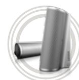
Lenovo 500 2.0 Bluetooth® Speaker